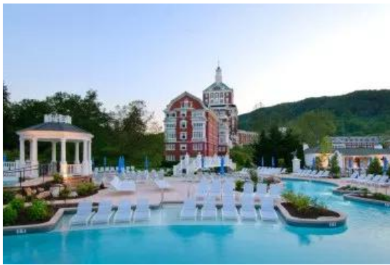
THE OMNI HOMESTEAD RESORT AND SPA