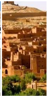
WHAT TO SEE, MOROCCO